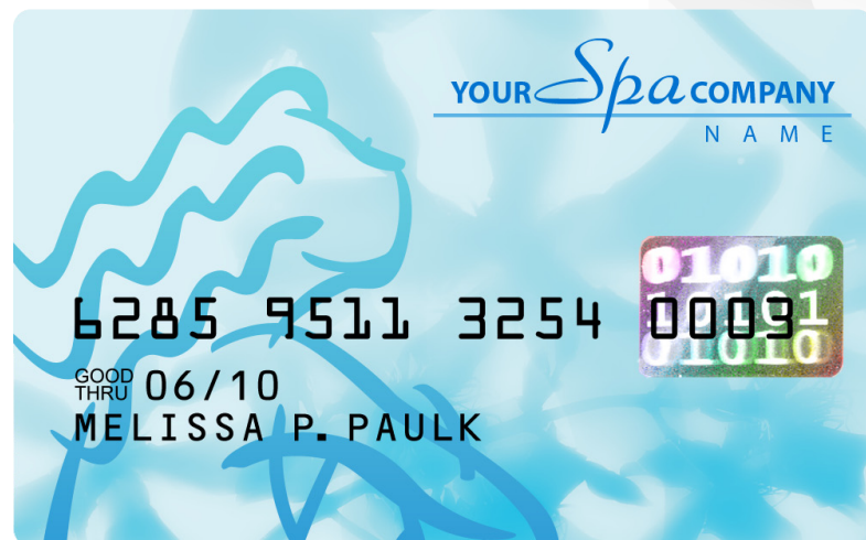
FIG.1 Sample Card